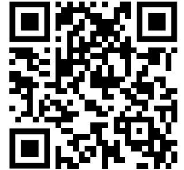
QR codes to guides

(These links will all be added to the Google Classroom)