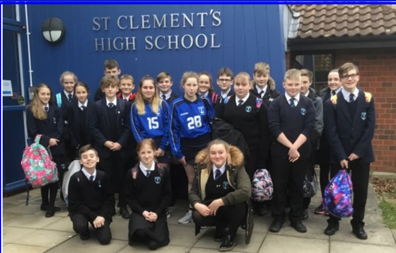
Above: Team St Clement's departing for Gala