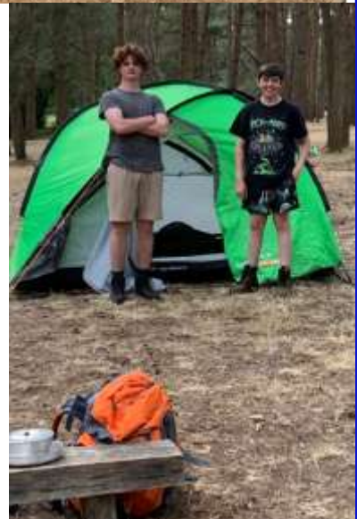
Setting Up Camp