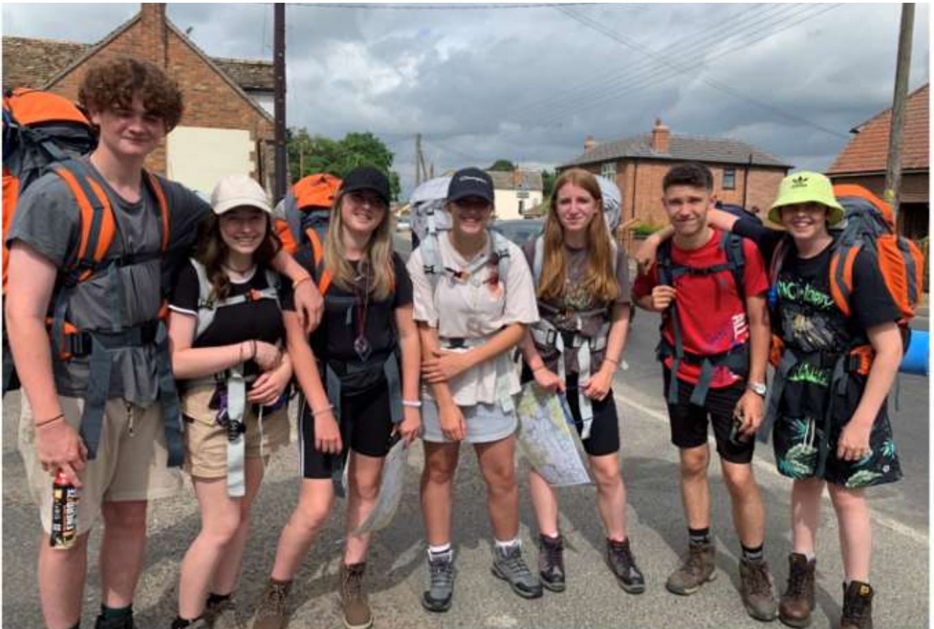
Below: The Start-Dino Rex