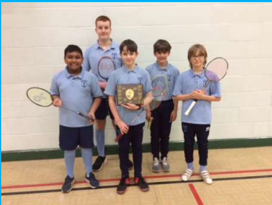
left: KS3 Badminton Team