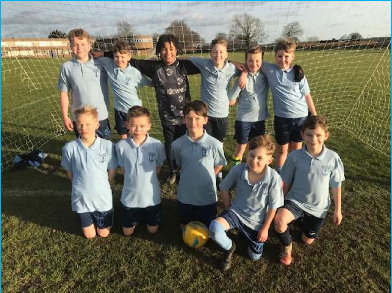
above: Year 7 Football Team