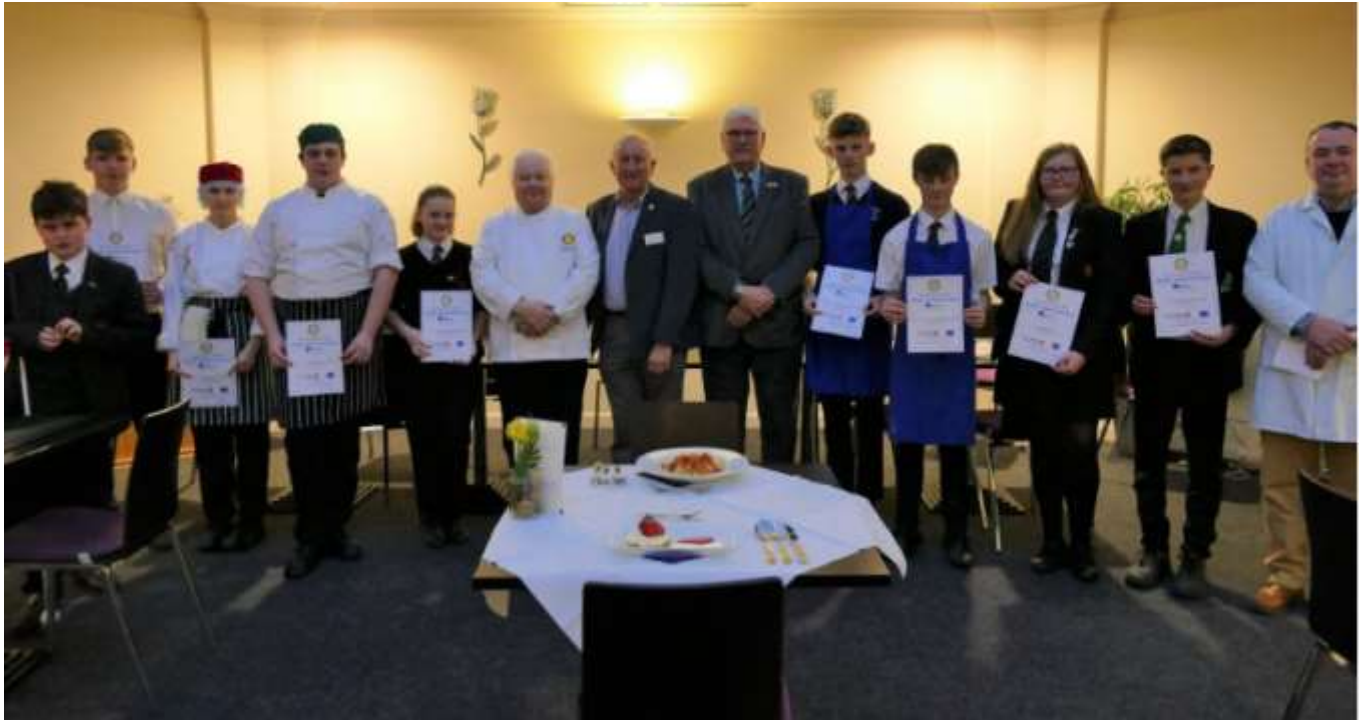
Above: competitors and judges at the second stage of the competition, held at College of West Anglia