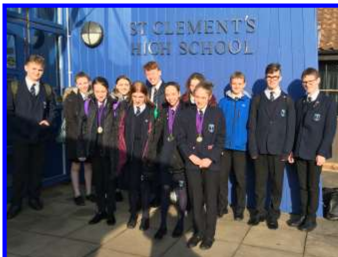
above: team St Clement's