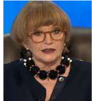
Above; Anne Robinson

Three St Clement's students took part in this Public Speaking competition. Under the gaze of Anne Robinson, it was 'nerve racking' but an enjoyable experience.