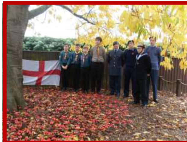
Above: poppies placed in memory to all those that lost their lives in all the wars.