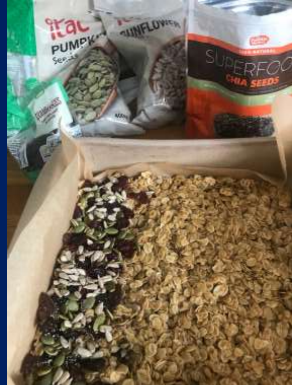
Albert-Flapjacks with chocolate, peanuts, sultanas, cranberries and a range of seeds.