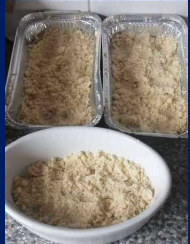
Keiran - 3 fruit crumbles

Bake off Entries in pictures- Year 7 Achievements