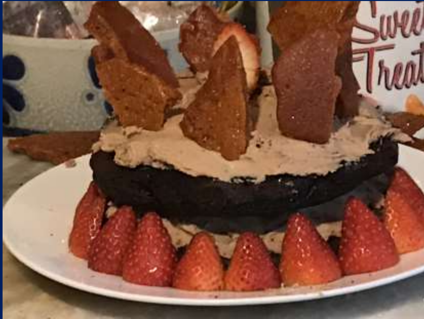
Jack - chocolate sponge cake with honeycomb shards on top and strawberries round the side