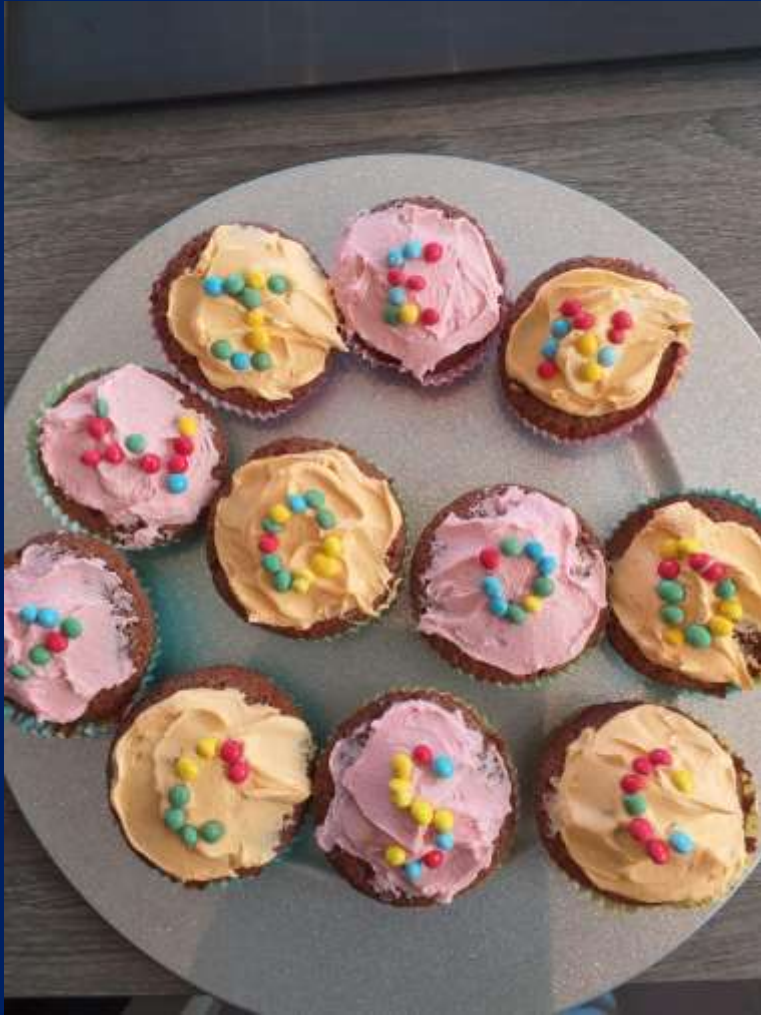
Jen - Personalised cakes