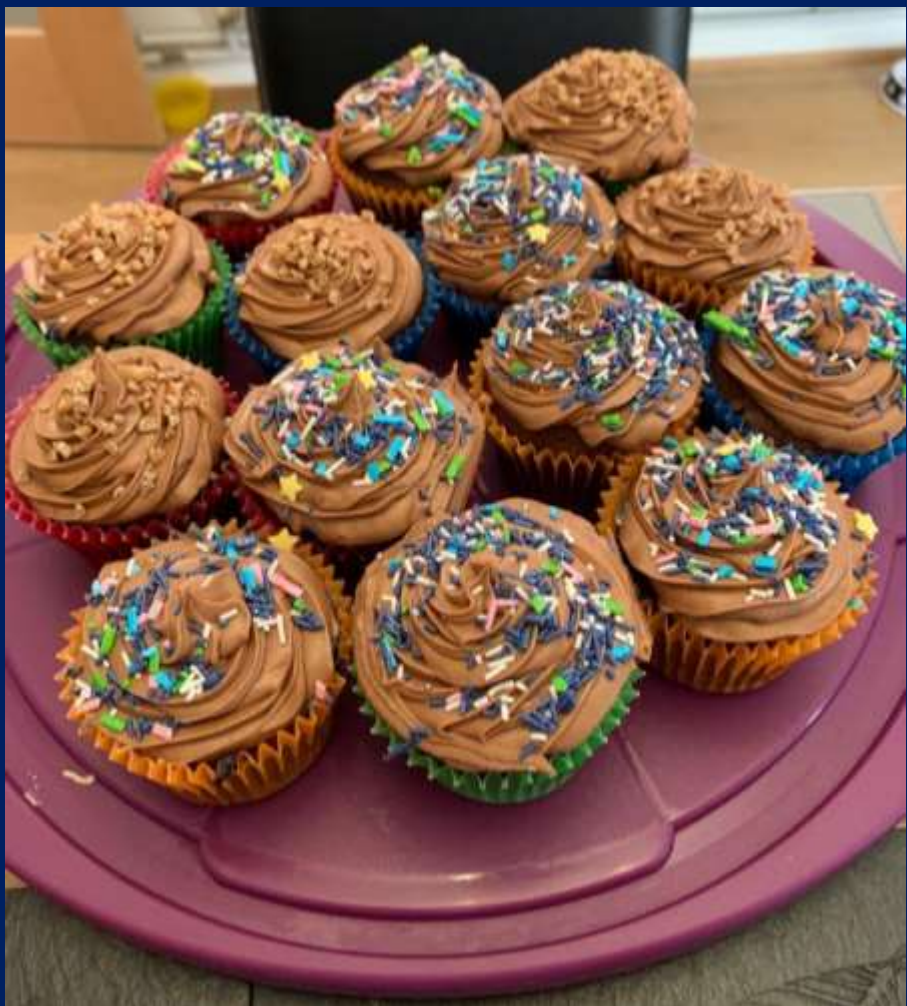
Libby- Cupcakes and cheese straws