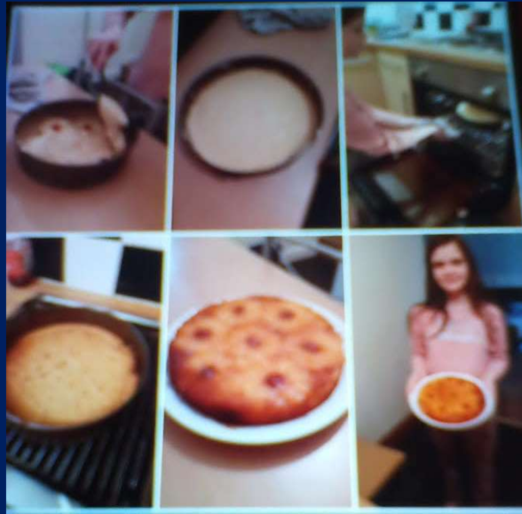
Sarah - upside down pineapple sponge