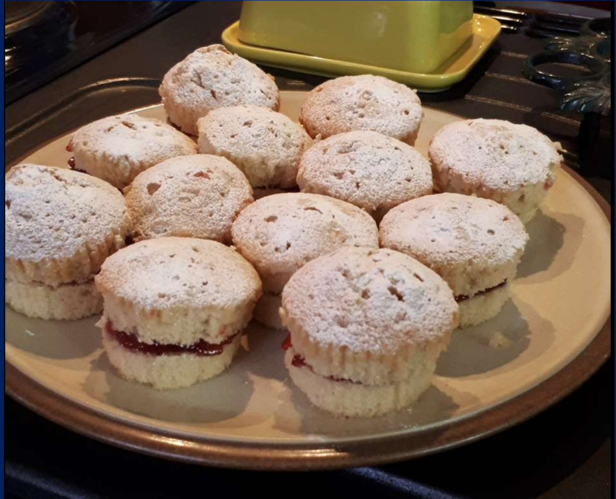
Lily- Mini victoria sponges

Bake off Entries in pictures- Year 7 Achievements