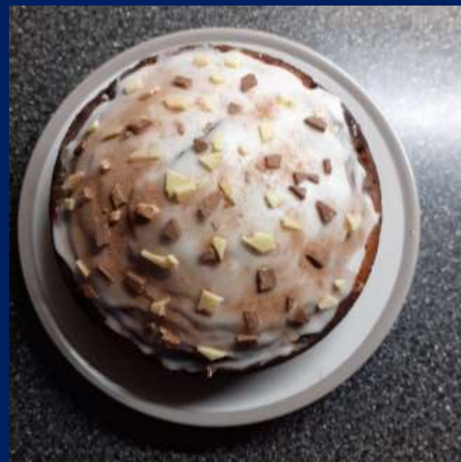
Rhys- Marble cake

Bake off Entries in pictures- Year 7 Achievements