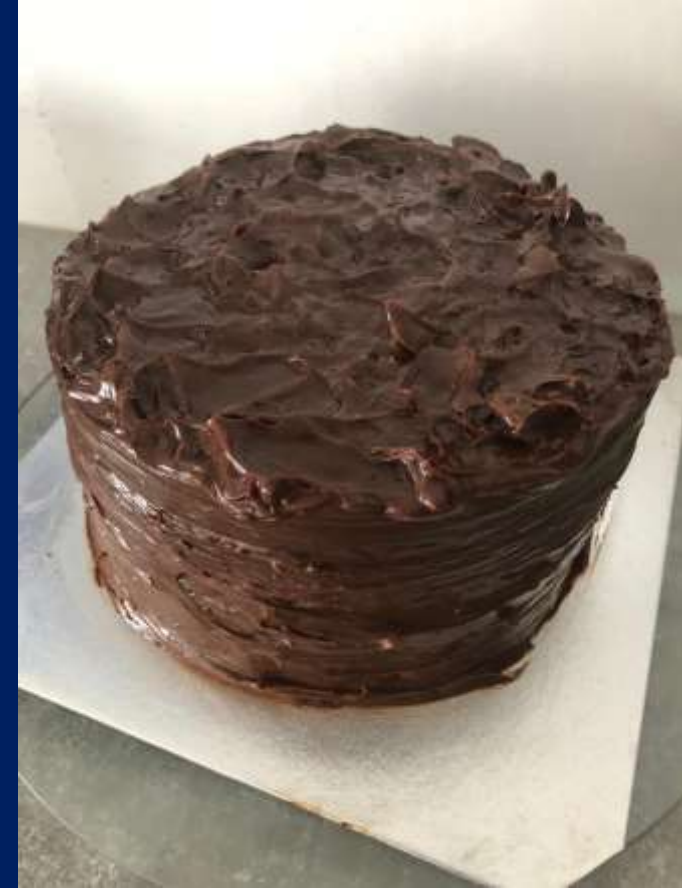
Fletcher- Layered Chocolate cake

Bake off Entries in pictures- Year 7 Achievements