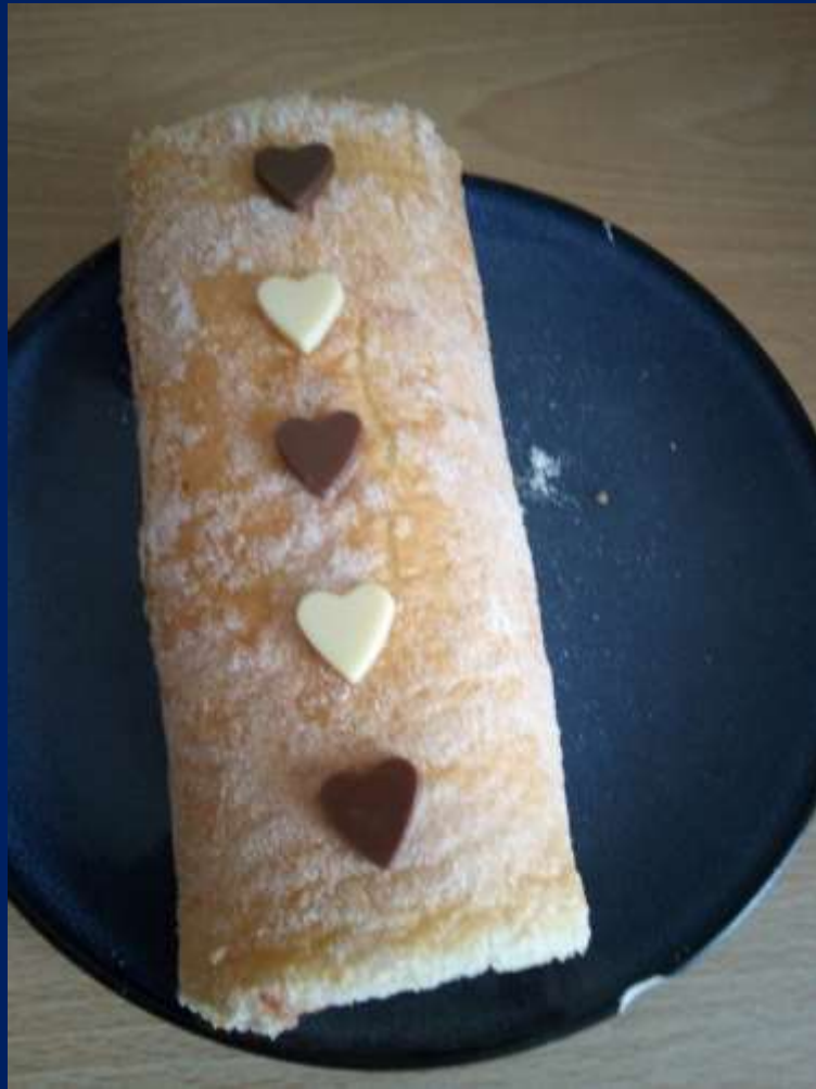
Lewis- Swiss Roll