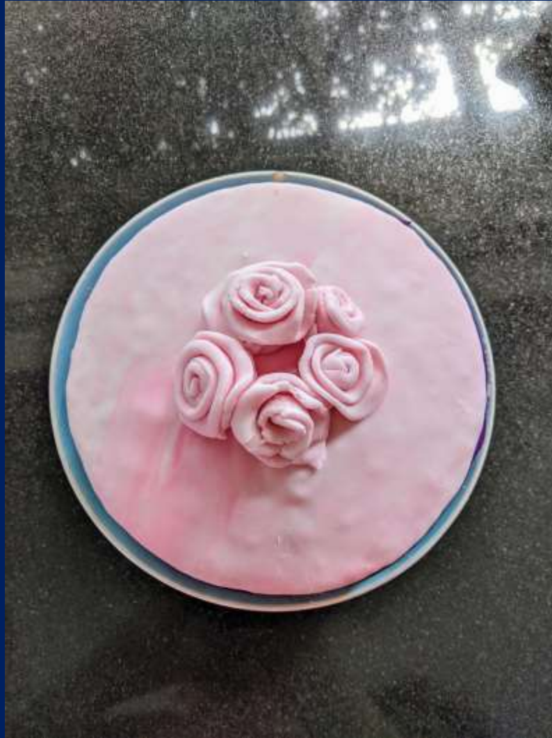
Olivia— Sponge cake with fondant icing and fondant roses.

Bake off Entries in pictures- Year 7 Achievements