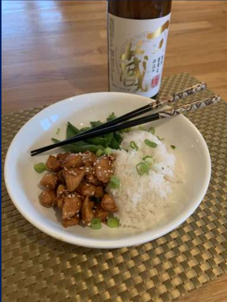
Seb - Teriyaki Chicken