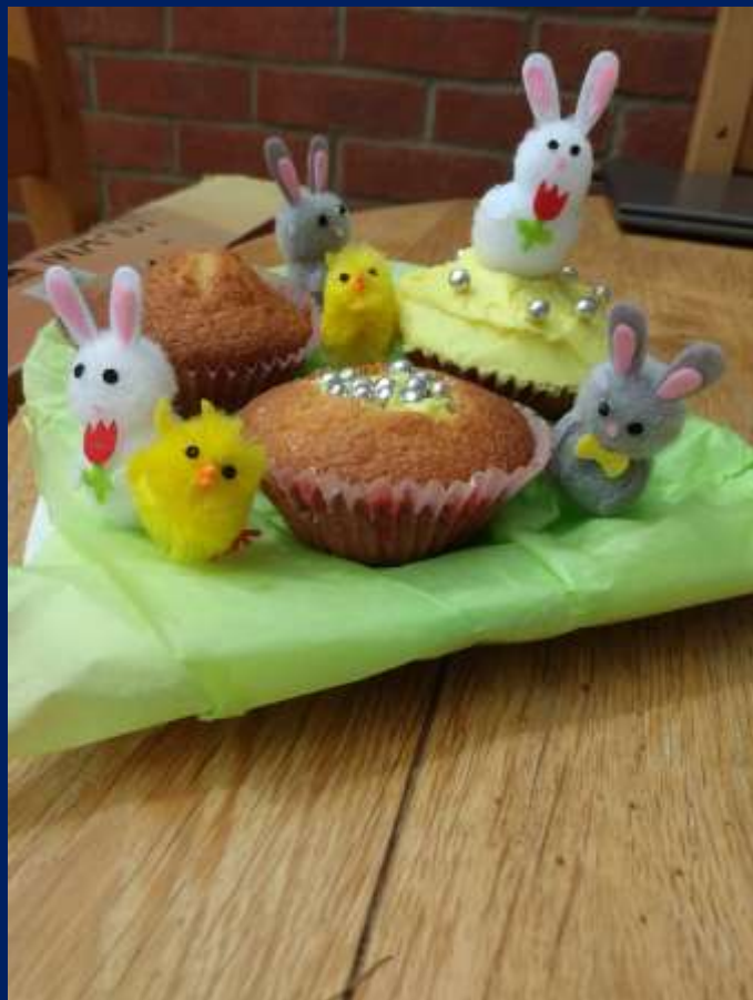
Amy- Easter/spring themed cupcakes