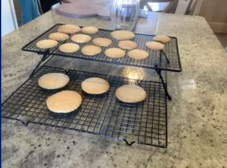
Isabella- flapjack and biscuits