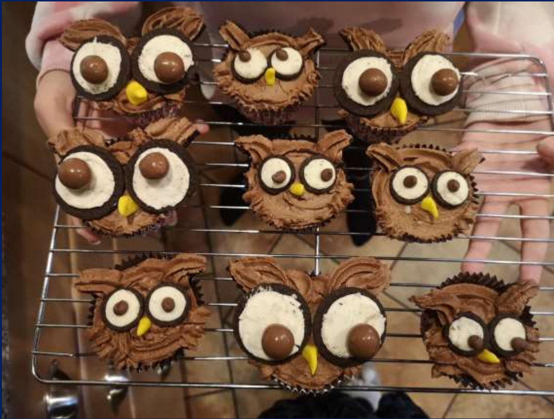
Isabelle - owl cup cakes