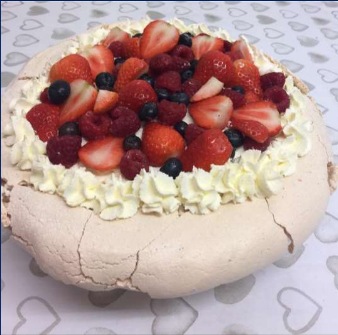
Chloe- pavlova with fresh cream and summer fruits