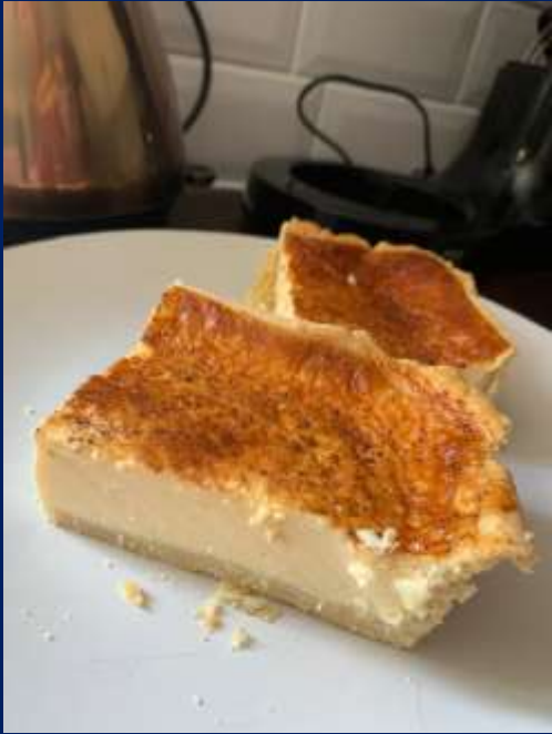
Amelie- Egg custard tart, cake with icing and sprinkles and a mars bar banoffee pie!