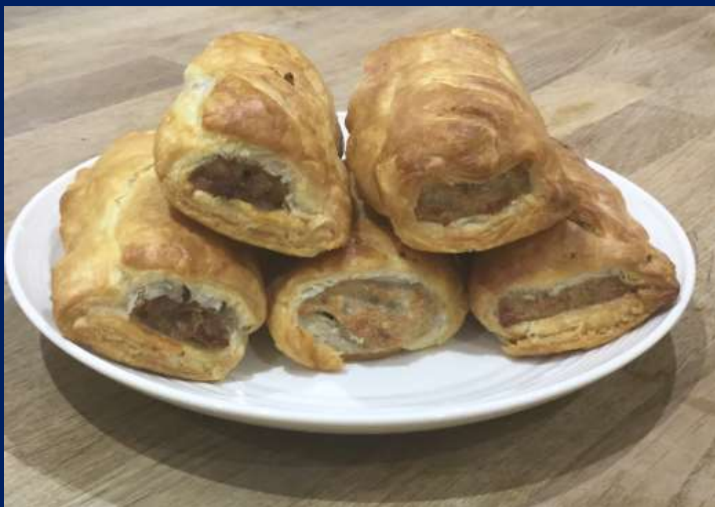
Amelia- Sausage Rolls