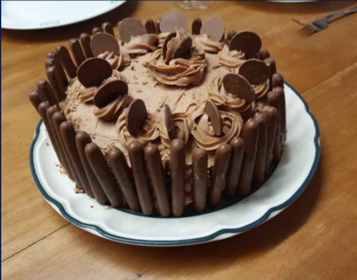
Lauren - Chocolate cake