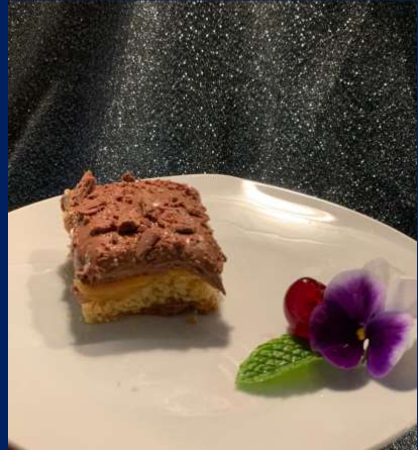
Evie- millionaires shortbread. It is a shortbread base with a homemade caramel in the middle, topped with Cadbury chocolate and flake.

Bake off Entries in pictures- Year 7 Achievements