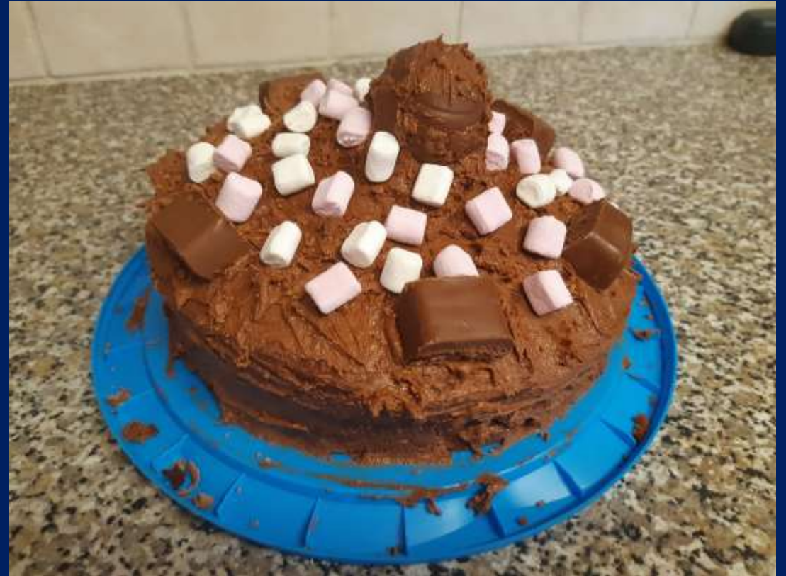
Connor - Chocolate cake

Bake off Entries in pictures- Year 7 Achievements