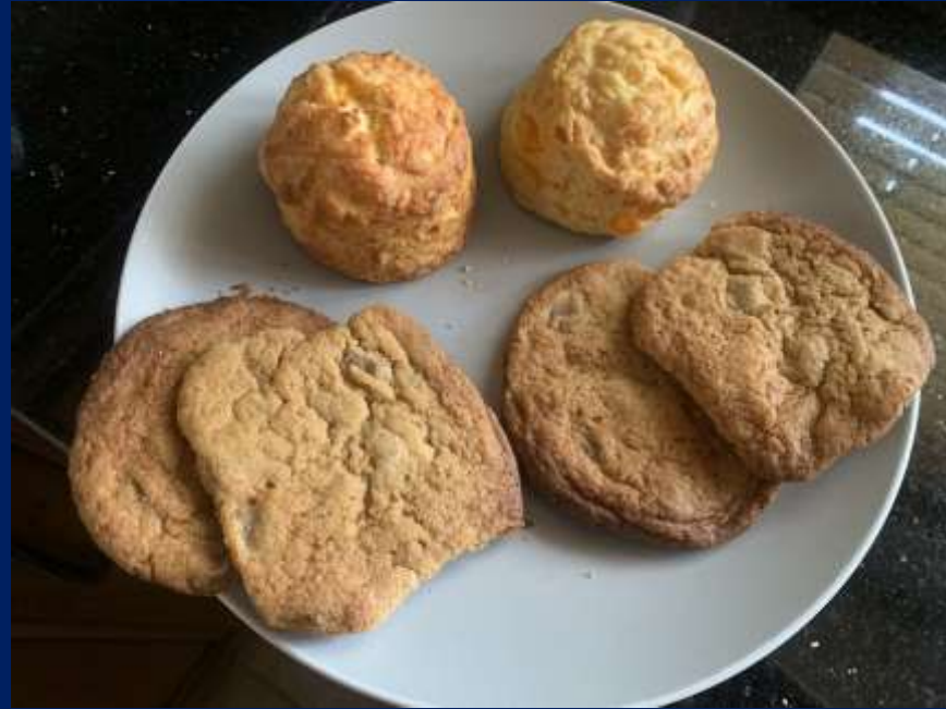
Lewis- Cheese scones and cookies

Bake off Entries in pictures- Year 7 Achievements