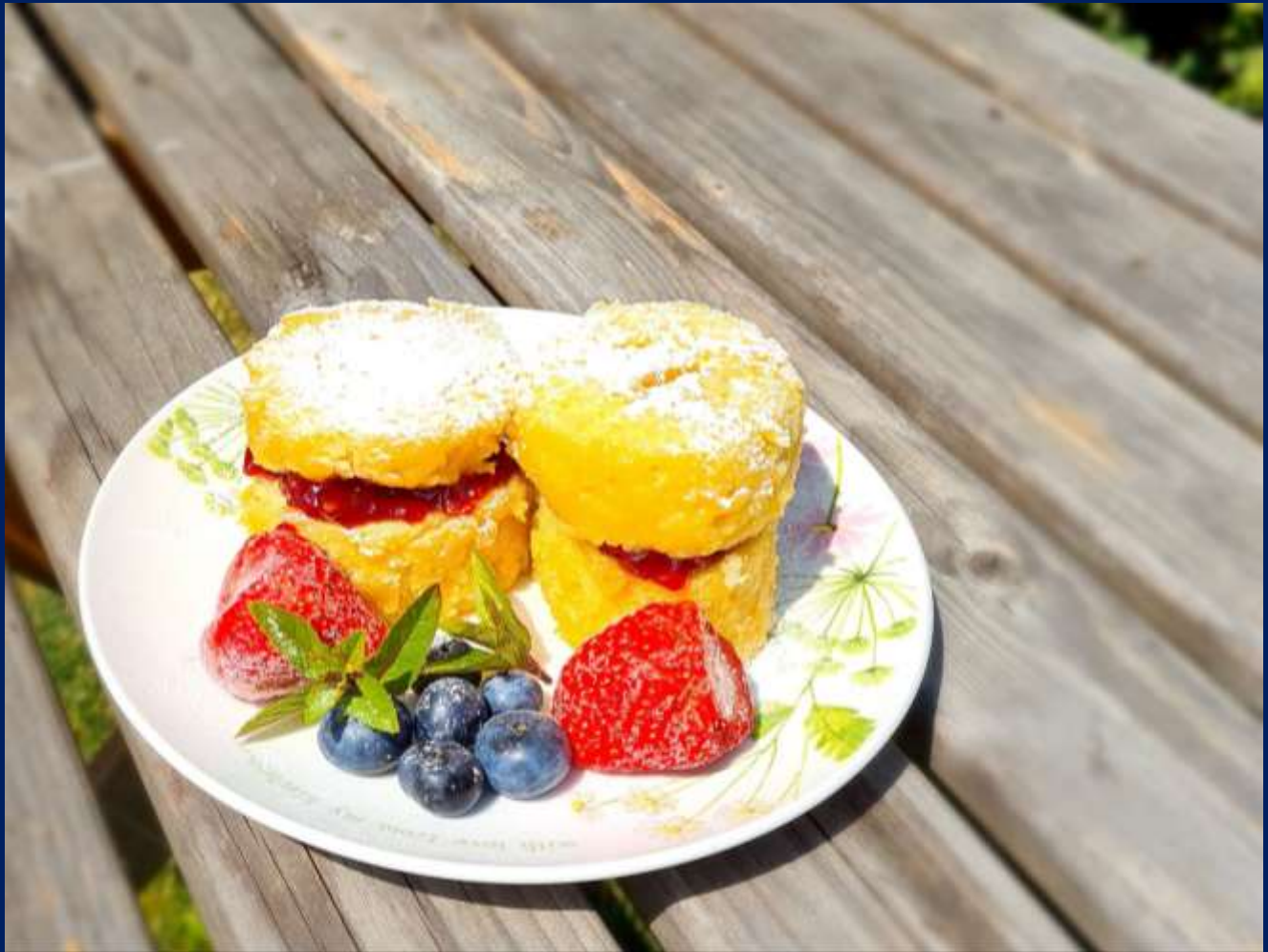
Louis - Mug cake