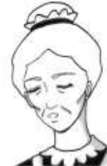
Edna Maid of the Birling household.