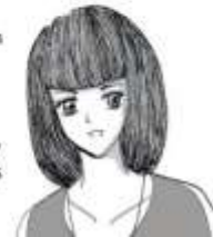
Eva Smith A young woman who unfortunately commits suicide. Her death unravels events and secrets amongst the Birling family.