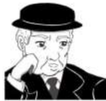
Inspector Goole A mysterious man who questions each member of the Birling family in relation to Eva Smith's death.