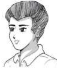
Eric Birling Son and youngest of the two Birling children. A very shy man.