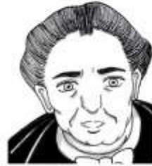
Arthur Birling Father and owner of Birling and Company.

How does Priestley present men and women in An Inspector Calls?