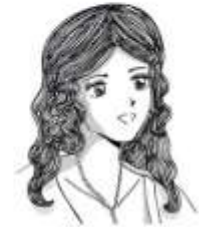
Sheila Birling Eldest child and daughter of Birling family. Engaged to Gerald Croft.