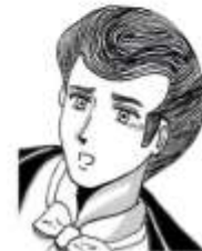
Gerald Croft Engaged to Sheila Birling. His father owns Crofts Limited, a rival company to Birling's.