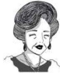
Sybil Birling Mother and wife of Arthur Birling.