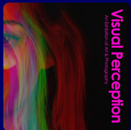
Visual Perception An Exhibition of Art & Photography