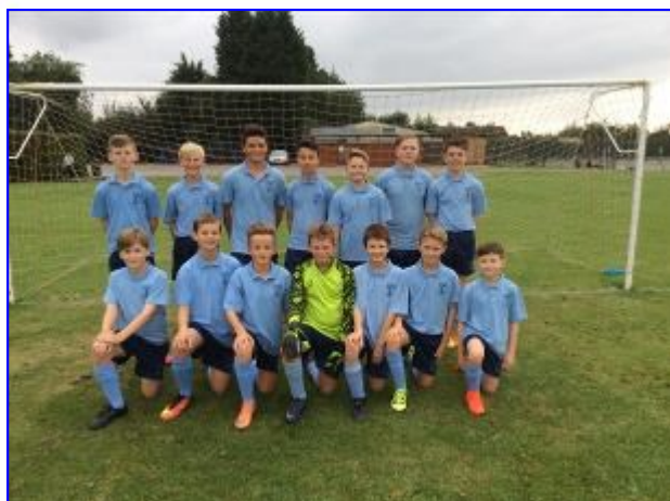
Year 8 Football Team