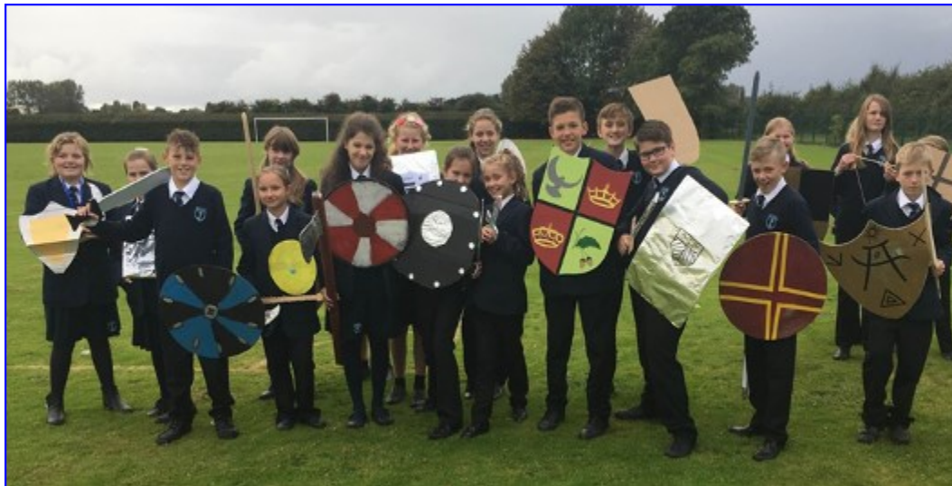
Some of our year 7's re-enacting the Battle of Hastings. We've gone bigger and better this year to celebrate this special anniversary.

14 th October 2016 to many, was an ordinary day; we got up, came to school, had our lessons and went home safe in the knowledge that it was Friday and we could have a lie in tomorrow! However, 14 th October 2016 wasn't an ordinary day, it was an anniversary, and not just any anniversary; 14 th October 2016 was the anniversary of 'arguably' the biggest turning point in the history of our island, of our culture, of our language and of our characters! 950 years ago today was The Battle of Hastings. You may be thinking why was that so important? It wasn't anything that big, like Henry VIII's creation of the English Church of England, or Elizabeth I's defeat of the mighty Spanish Armada, or even as big as the chopping off of King Charles I's head leading to people power in the short lived Republic of England (thankfully it was short lived in my opinion). It was bigger than all of those events for one significant reason, it was the end of the tribal Anglo Saxon England and the beginning of the hierarchical, monarchy driven, "modern" England. 14 th October 1066 was the last time England was ever successfully and fully conquered by a foreign power. 1066 saw the Norman / French Duke, William of Normandy defeat the Anglo Saxon ruler Harold Godwinson on the south coast around Hastings, that we all know, but what was the real impact of this?