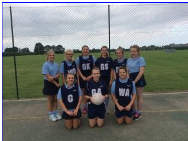
Year 9 Netball Team