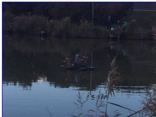
Fishing competition at Buttonhole Lake.