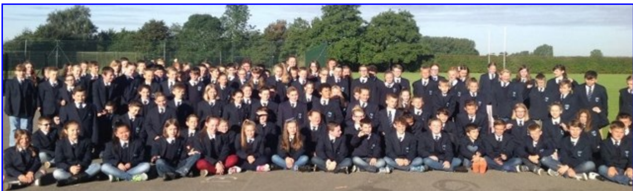
Above: photograph published in Lynn News & Advertiser 30/09/16 showing students who exchanged school trousers and skirts for jeans.