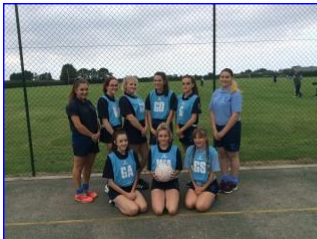
Year 10/11 Netball Team