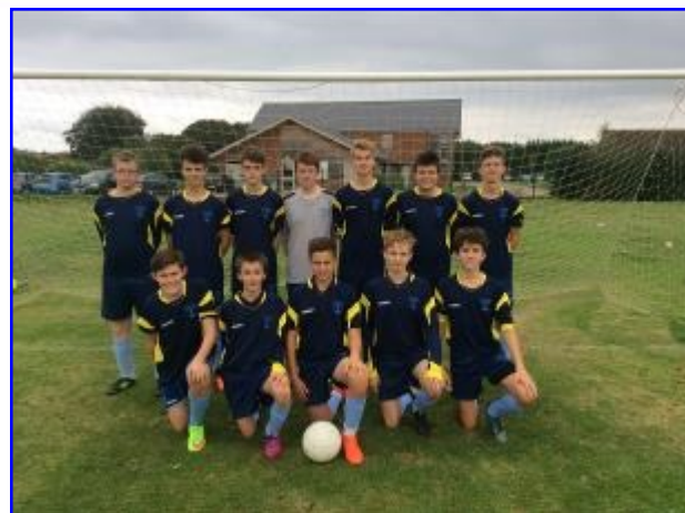
Year 10 Football Team