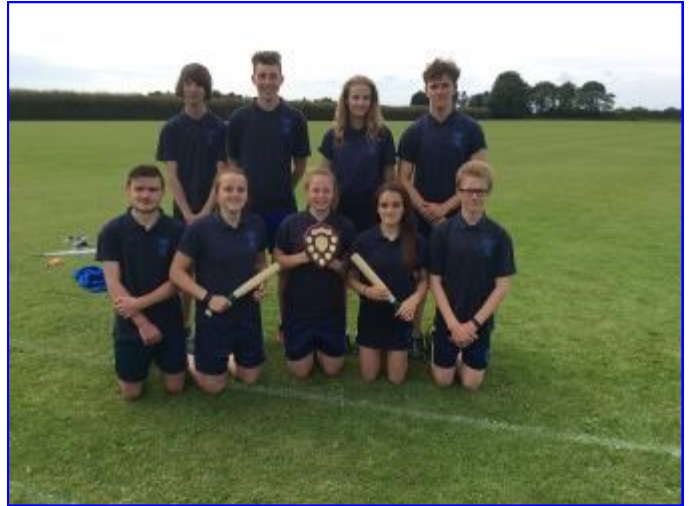
Under 15 mixed West Norfolk Champions!

The season is drawing to a close. Years 7, 8 & 9 have competed well and completed all their fixtures. The year 10 girls' team are in contention to become West Norfolk Champions. With two matches remaining, they are undefeated, playing to a very high standard throughout the season. The annual U15 mixed rounder's tournament is staged at St Clements and went ahead as planned on Wednesday 6 th July. Once again, the school performed very well and ran out clear winners with a 100% record and are now West Norfolk Champions.