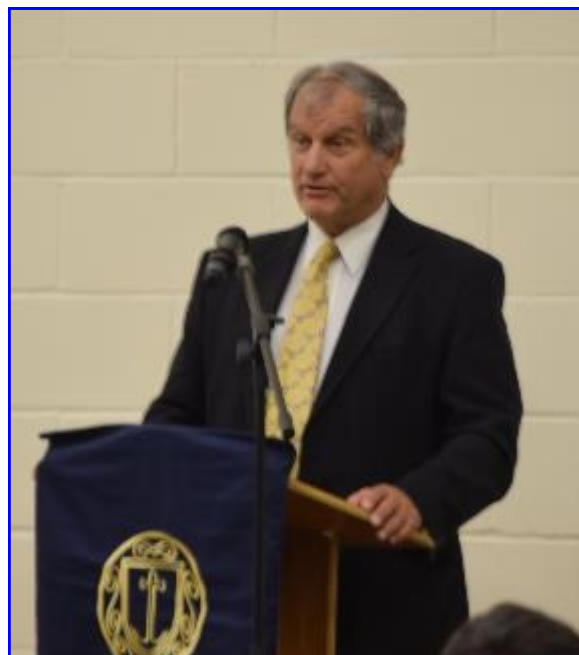
Above: Guest speaker Bob Champion

The audience of students, parents, carers and invited guests were treated as Bob Champion gave a real insight into his rise to fame, his battle against cancer through to his historic win at the Grand National and subsequent involvement with The Bob Champion Cancer Trust.