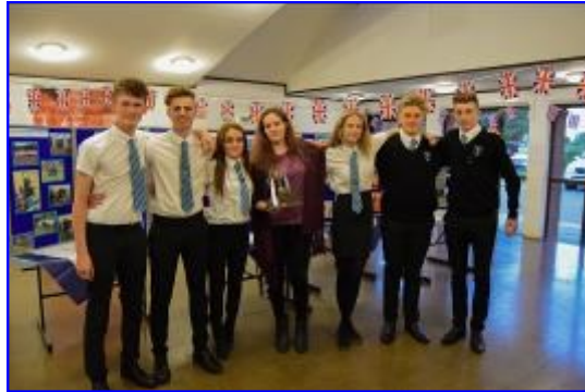
KS4 Badminton Team

School Team of the Year; shared between KS4 Girls & KS4 Boys Badminton Teams who both won the County Championships and the Angling Team who won the Active Norfolk County Angling Final.