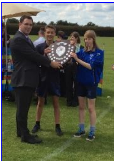
Brunel accepting the trophy!!

Despite the poor weather, the school sports day was eventually completed Monday 4 th July. The overall winners were Brunel, winning the event for the 3 rd successive year. The following students all set new records during the athletics season; -